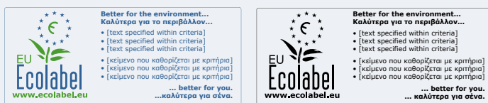
Optional logo example.

Include any desired translations of bullet points into EU languages in one box with the translation of 'Better for the environment..., ... better for you' in all corresponding EU languages.