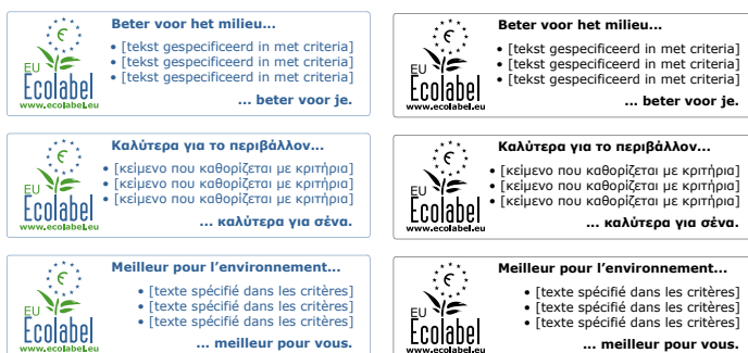
Optional logo example.

Create different boxes for each different EU language translation.