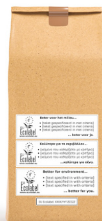
Optional logo example on product.