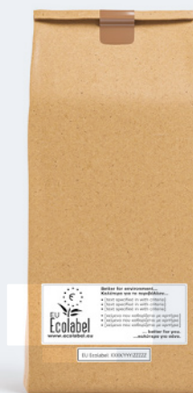
Optional logo example on product.