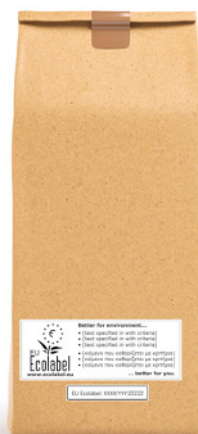
Optional logo example on product.